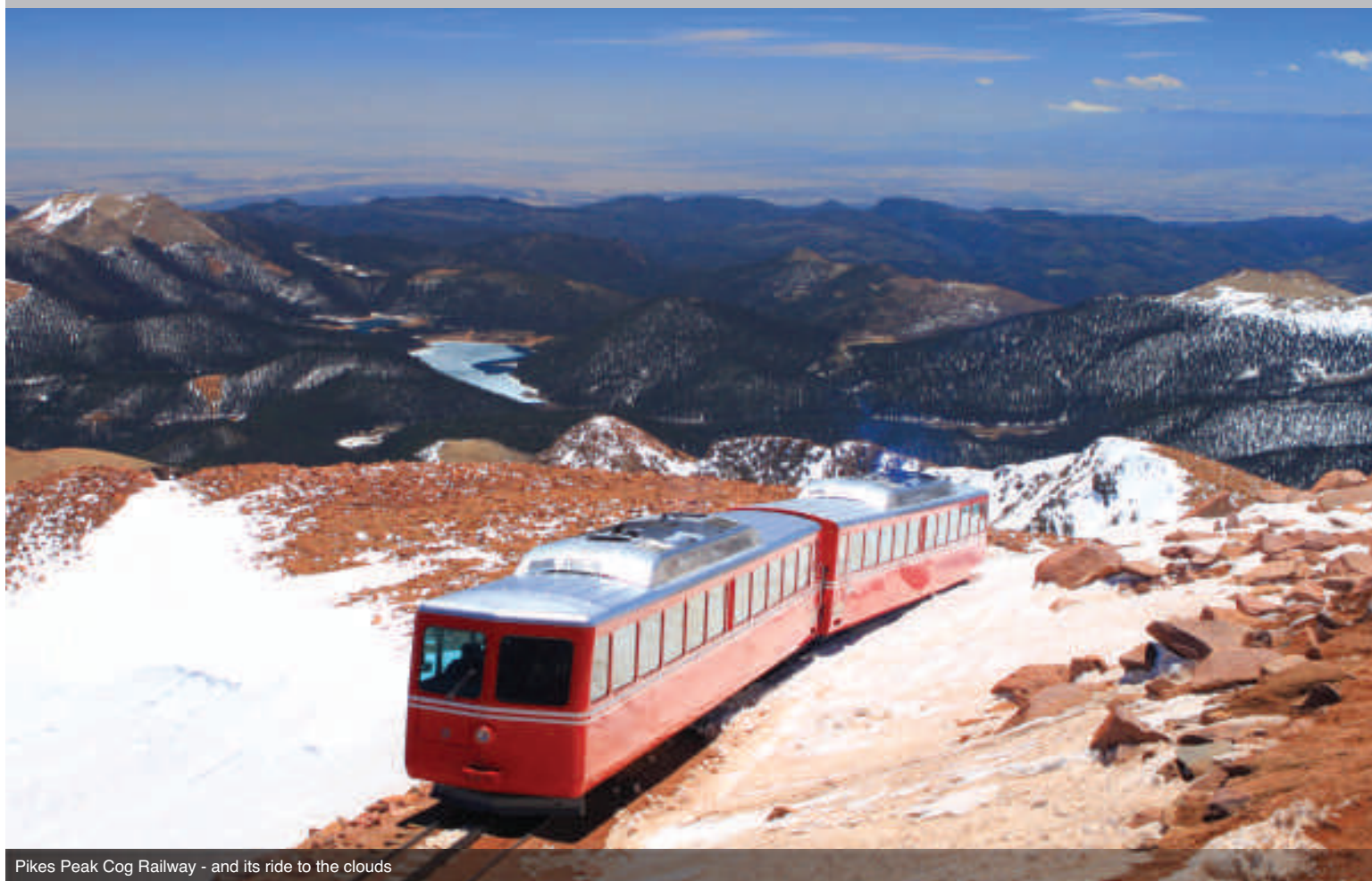
Pikes Peak Cog Railway - and its ride to the clouds