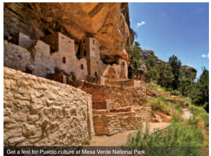
Get a feel for Pueblo culture at Mesa Verde National Park