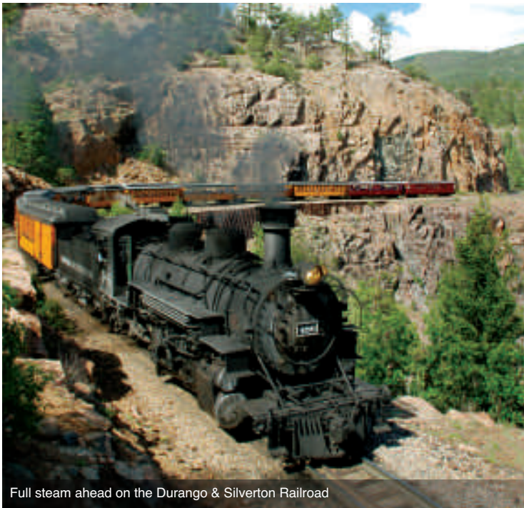
Full steam ahead on the Durango & Silverton Railroad