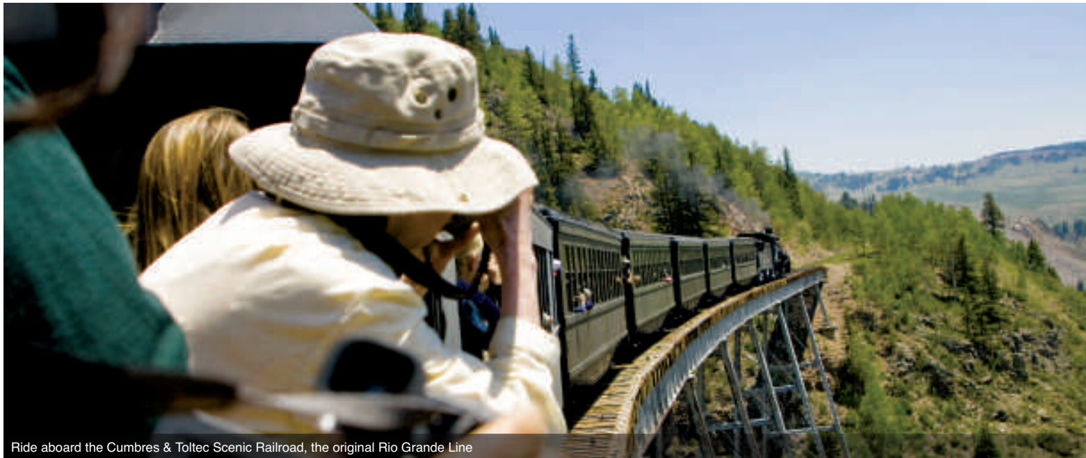
Ride aboard the Cumbres & Toltec Scenic Railroad, the original Rio Grande Line