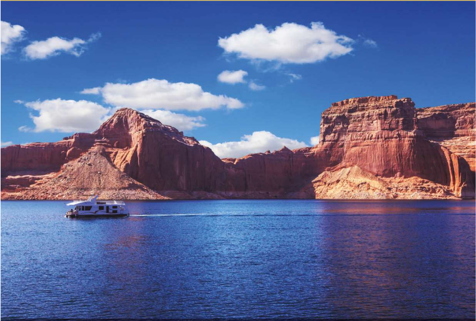
Enjoy a "Canyons Adventure" cruise on the sky-blue waters of Lake Powell