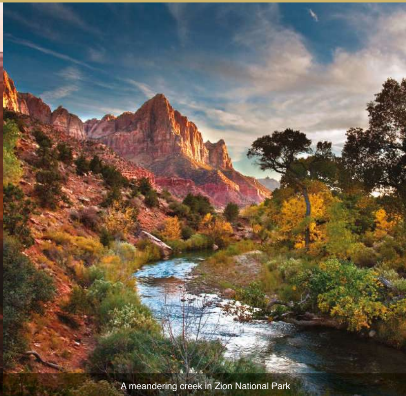
A meandering creek in Zion National Park