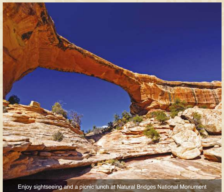
Enjoy sightseeing and a picnic lunch at Natural Bridges National Monument

This morning we'll leave Utah and travel through the Virgin River Gorge en route to Las Vegas McCarran International Airport for flights home departing after 1:00 p.m. Meal: B