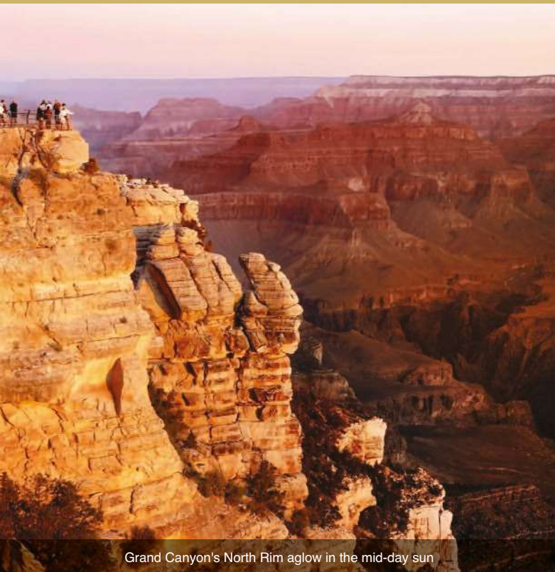
Grand Canyon's North Rim aglow in the mid-day sun